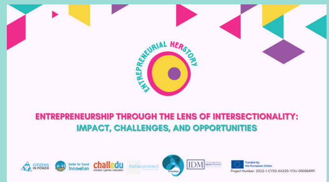
Cover page of EH Podcast Series graphics

Both the Guidebook and all Podcast episodes are available in 5 languages , including English (EN) and all national languages of the partner organisations, namely Greek (EL) , Dutch (NL) , Romanian (RO) , and Spanish (ES) .